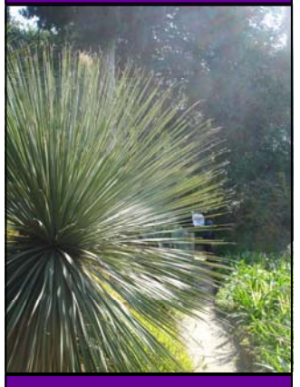
Serre de la Madone

the Conservatoire du Littoral (the government agency for the protection of the coastline now maintains the property.